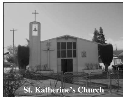
St. Katherine's Church