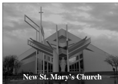
New St. Mary's Church