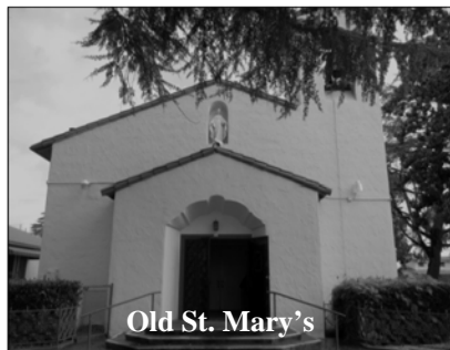
Old St. Mary's